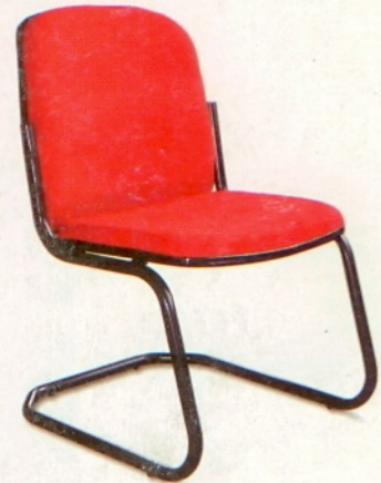
PCH - 7112