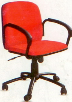
PCH - 7102R

These products have been tested as per derived BIFMA (Business & Institutional Furniture Manufacturers' Association) standards.