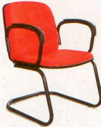
PCH - 7112R